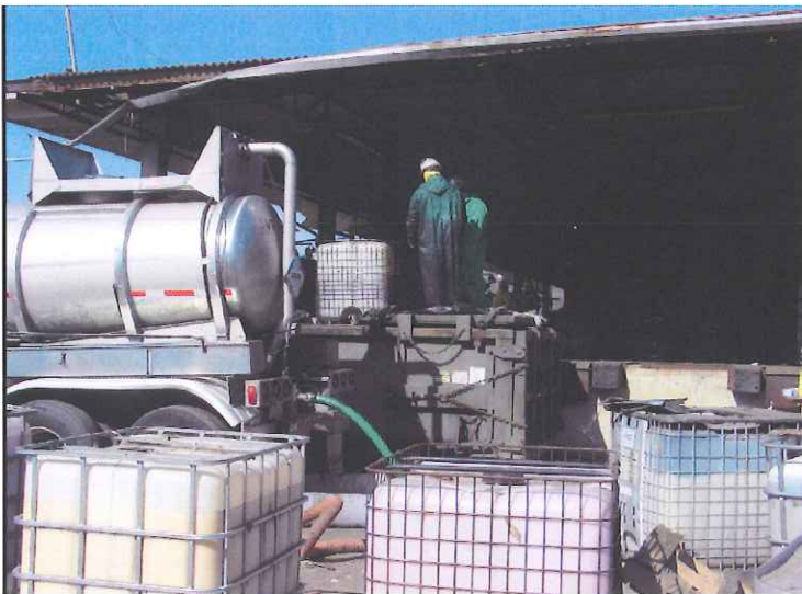
The photograph to the left shows DHEC's contractors sampling and segregating the liquids and sludge stored in the chemical totes.

Soil samples were collected after the chemical totes were removed.