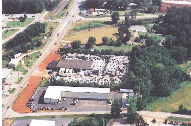
This aerial photograph predates DHEC's removal action.

In FY08, DHEC, through its contractors, completed its removal of approximately 9462 large chemical containers (or totes), which were stacked haphazardly and leaking unknown substances. Samples were collected to determine proper disposal methods for waste streams including the following: