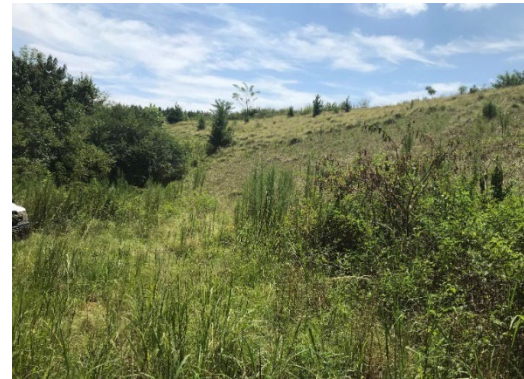
Reclaimed Mine Area