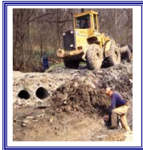
Temporary Stream Crossing