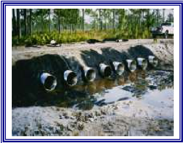
Temporary Stream Crossing