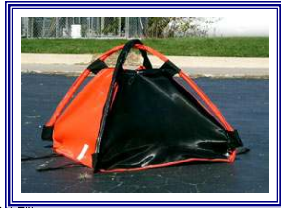
Rigid Inlet Filters