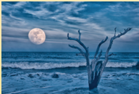
"New Moon Over Hobcaw Beach" by Donald Withers

www.scdhec.gov/environment/ocrm/tides2013.htm