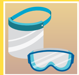
Face shield or goggles

These precautions are required upon ALL room entries, regardless of anticipated patient contact.