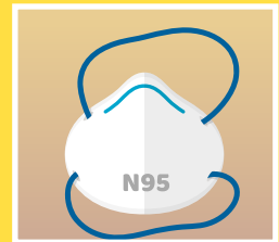
N95 respirator or facemask if not fitted