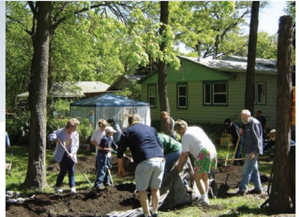
Stormwater management choices affect all communities