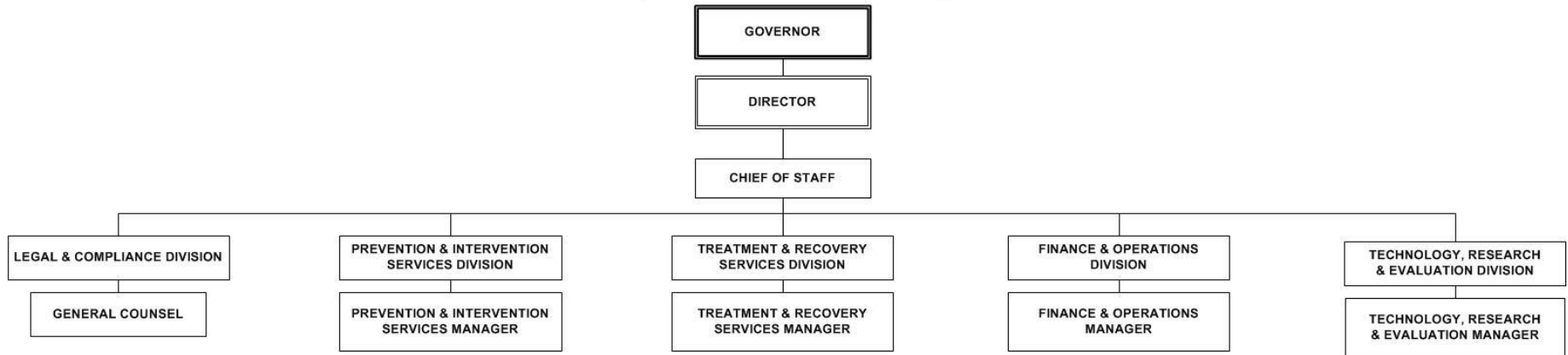
Figure 5. DAODAS organizational chart (accurate as of July 2, 2019)