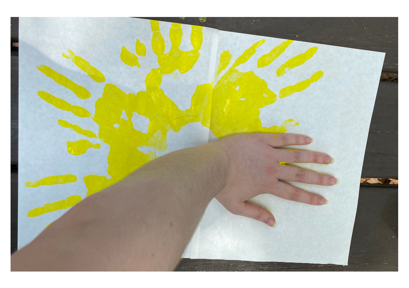
Step 2: Cover hand in paint then place handprint(s) around the circle.