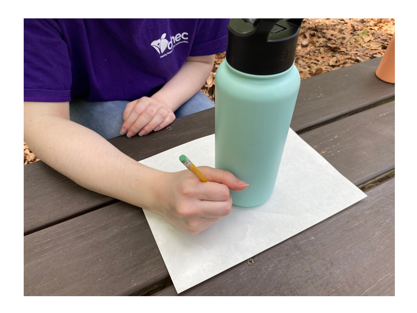
Step 1: Find a round object, position in the center of paper and trace it.