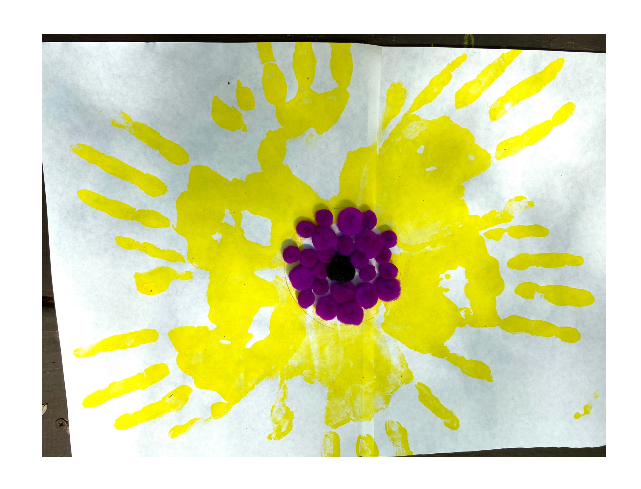
Step 3: After washing the paint off your hand, grab your puff balls (or buttons) and glue them in the center of the circle.