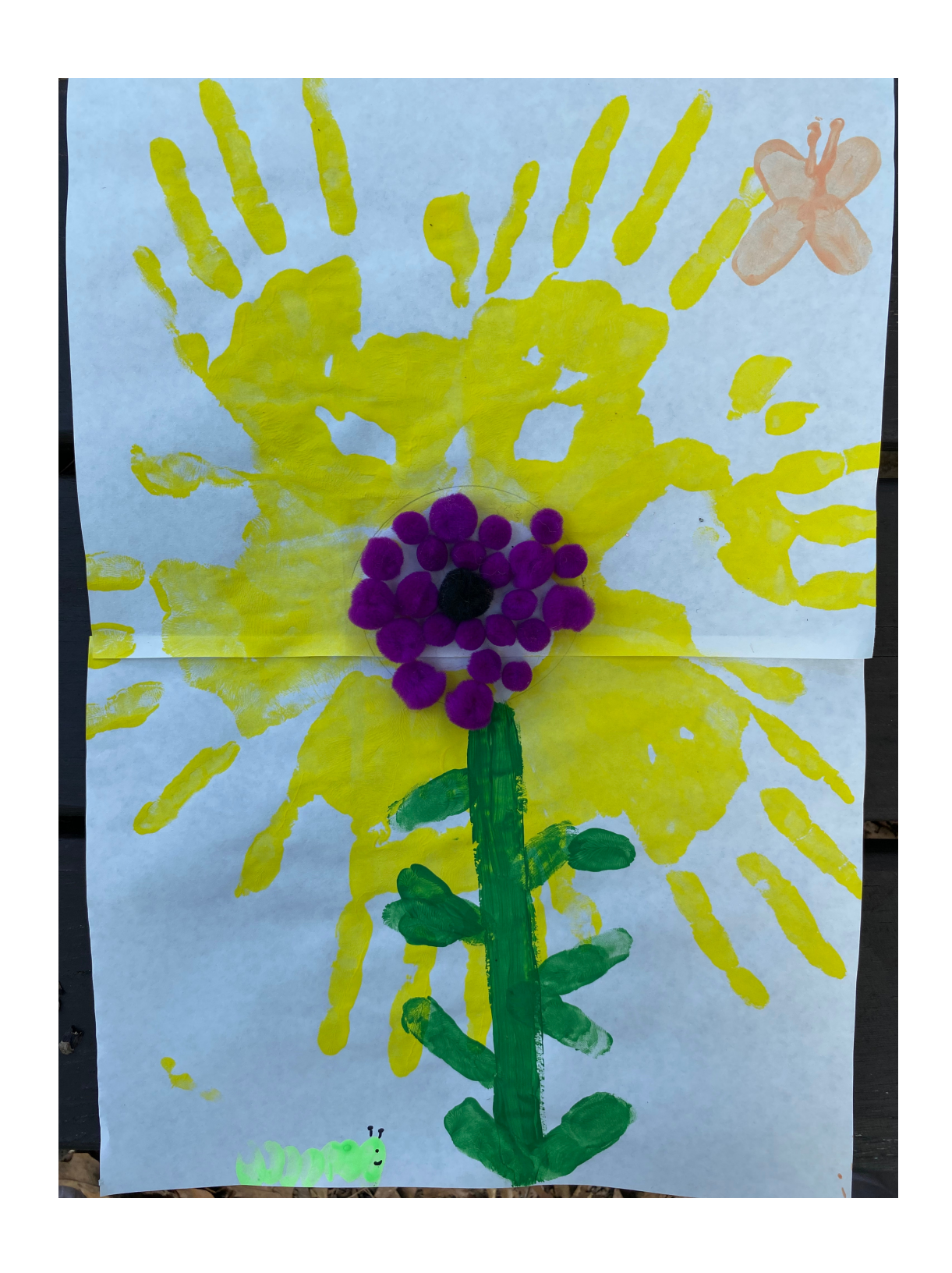
Step 6: Let it dry, and now you have a handprinted flower and fingerprint bugs.